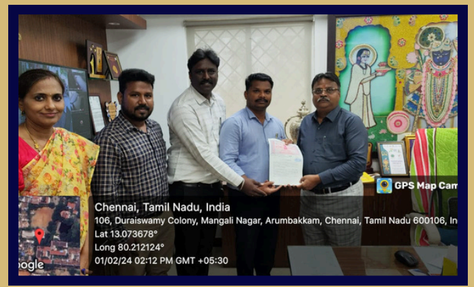
MoU - VALUE ADDED COURSE