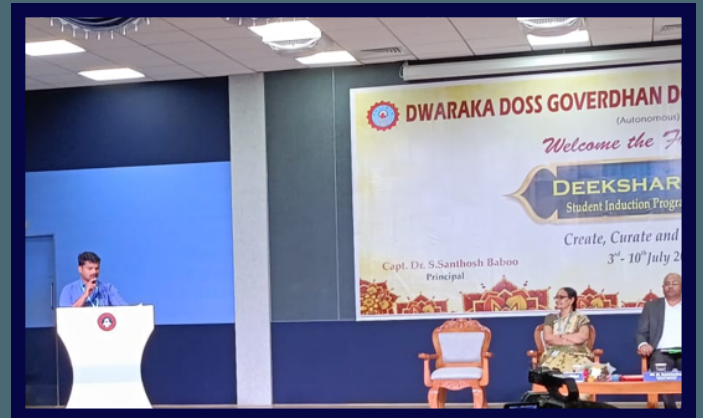
SIP - DEEKSHARAMBH