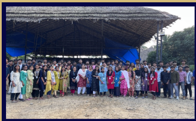
EVS FIELD TRIP