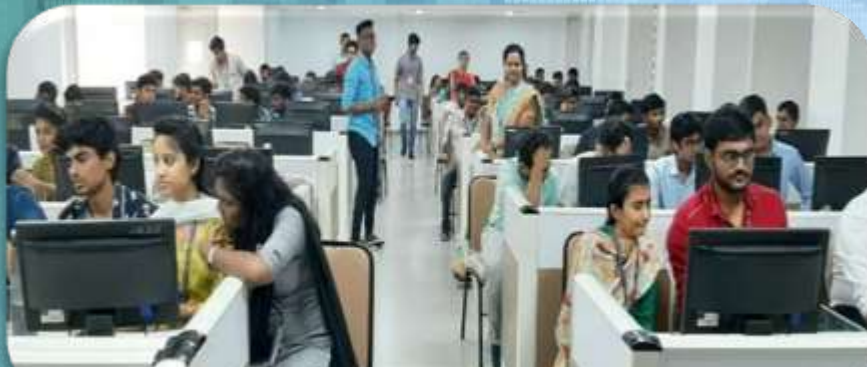
THE QUIZZING EXYTRAVAGENZA-"QUIRJOZITY"