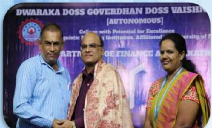
GUEST LECTURE ON TAXATION POLICIES