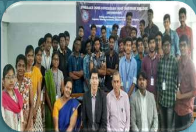
SEMINAR ON ETHICS & PROFESSIONALISM