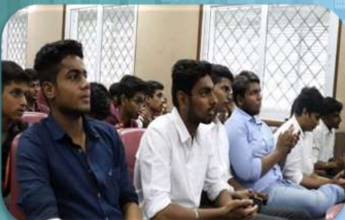
REVIEW & DISCUSSION ON UNION BUDGET