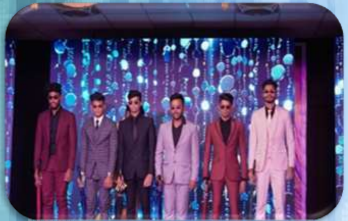
"SPECTRE" INTER COLLEGIATE CULTURALS