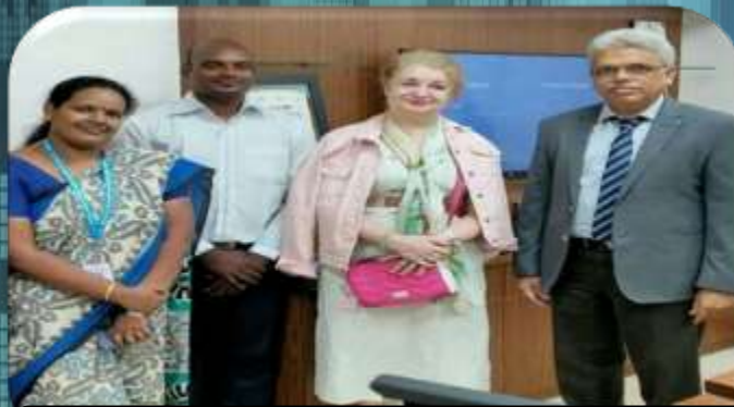
ORIENTATION ON ACCA COURSE