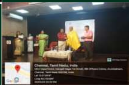
INTERNATIONAL FACULTY DEVELOPMENT