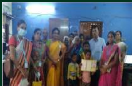
SOCIAL SERVICE ACTIVITY