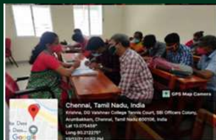
PARENTS TEACHERS MEETING