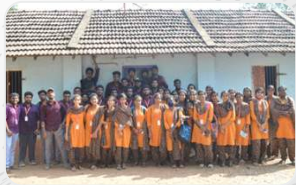
TEAM - VIDHAI