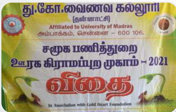
BANNER OF VIDHAI