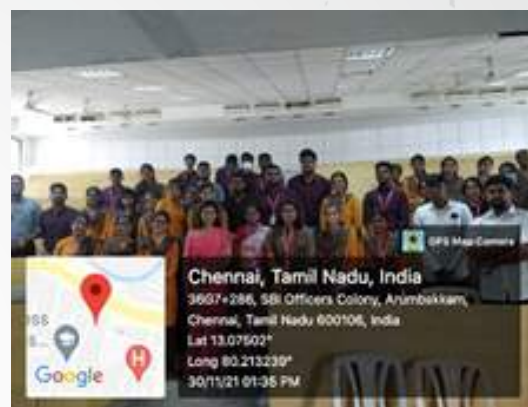
Orientation on CSR