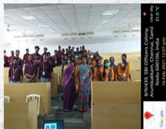
Social Work In Correctional Setting