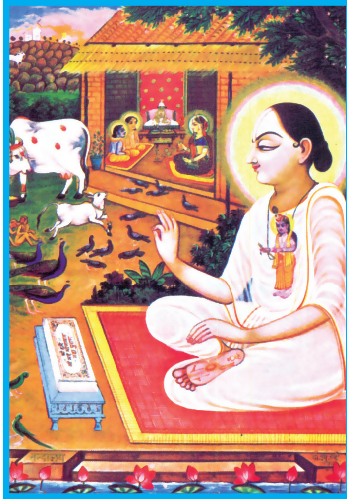
Jagad Guru Shrimad Vallabhacharya