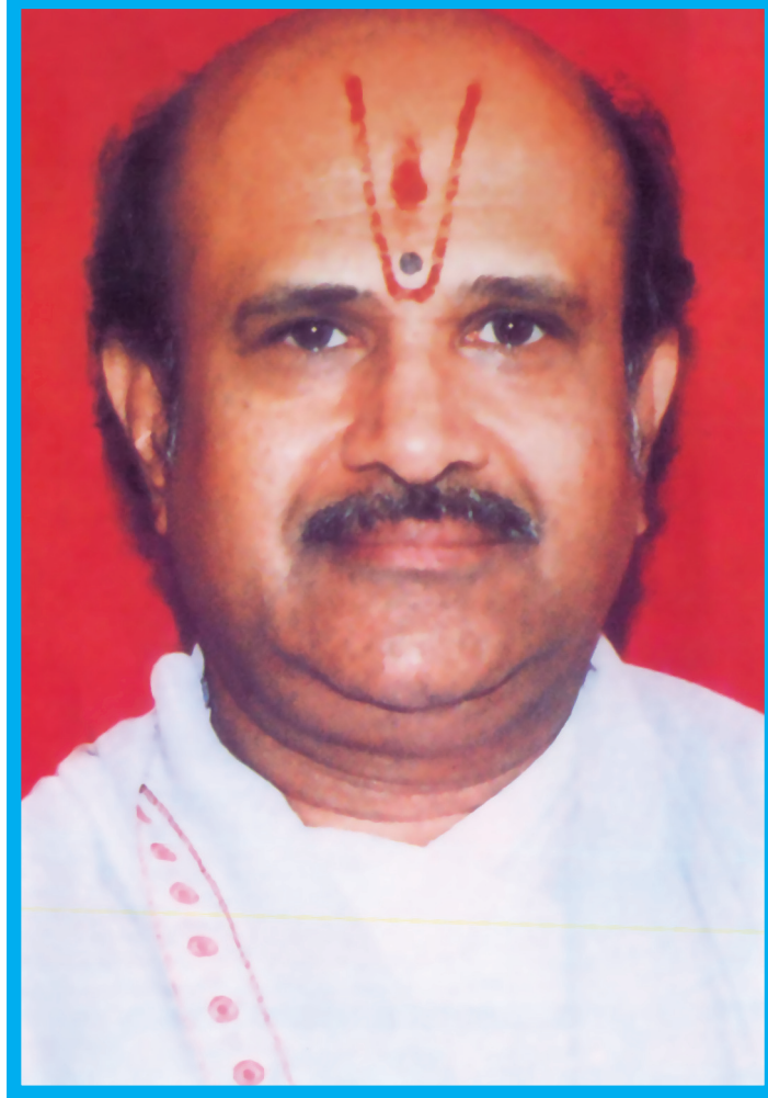
Anantha Shri Vaibhushith Jagadguru Srimad Vallabhacharya Mahaprabhu Pravarthith