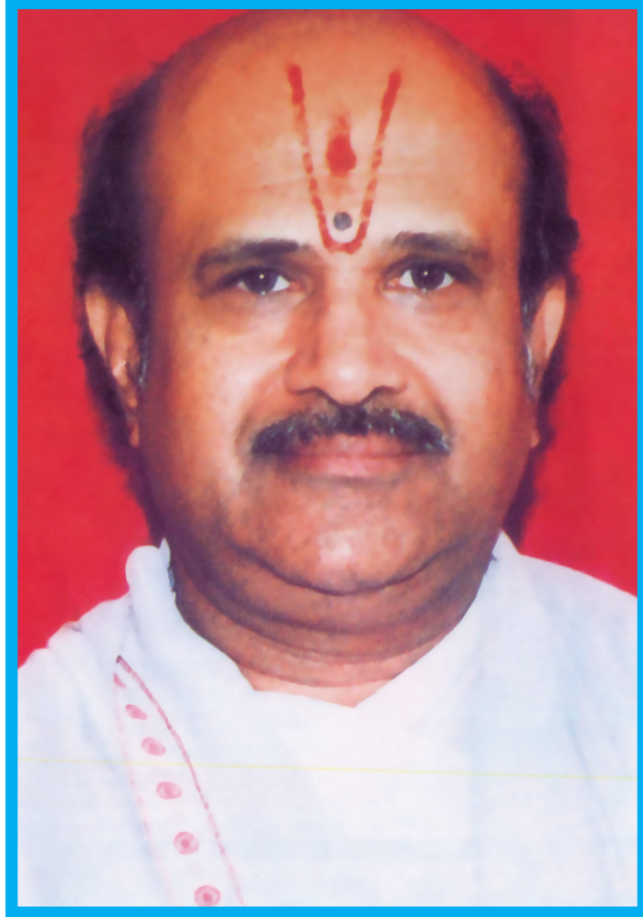
Anantha Shri Vaibhushith Jagadguru Srimad Vallabhacharya Mahaprabhu Pravarthith