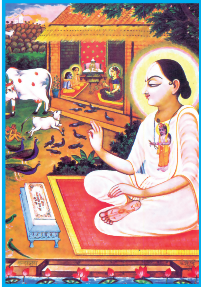
Jagad Guru Shrimad Vallabhacharya