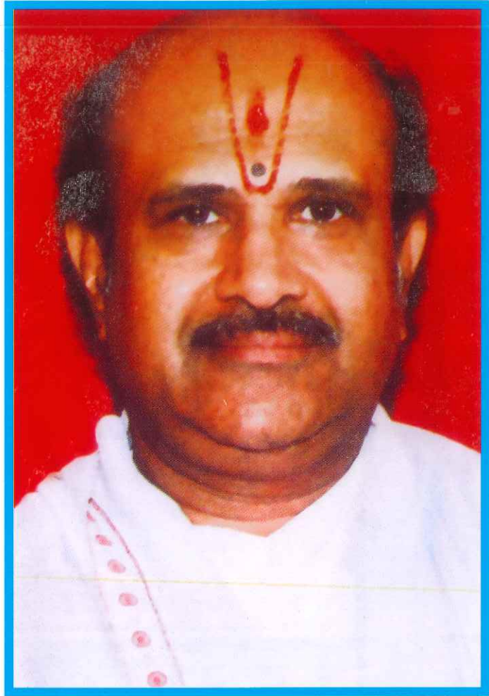
Anantha Shri Vaibhushith Jagadguru Srimad Vallabhacharya Mahaprabhu Pravarthith