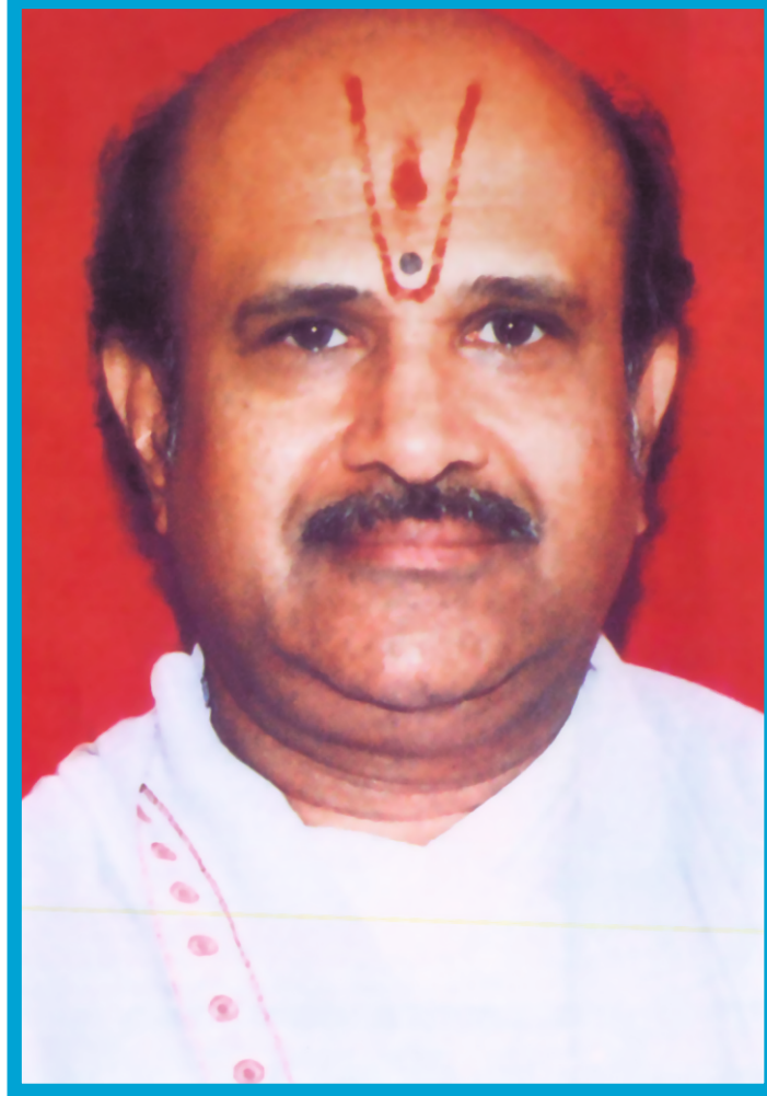
Anantha Shri Vaibhushith Jagadguru Srimad Vallabhacharya Mahaprabhu Pravarthith