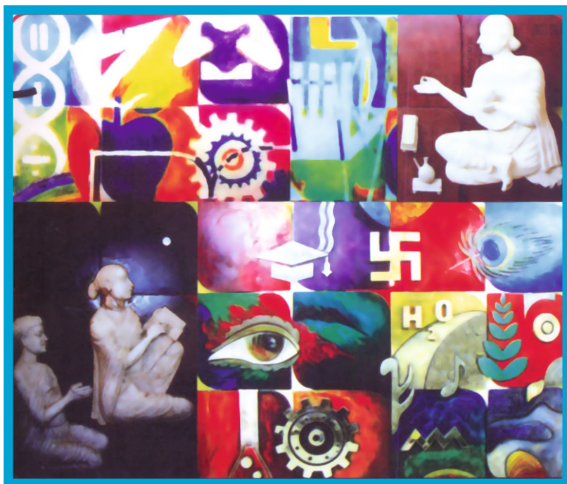
Mural Painting in the New Administrative Block