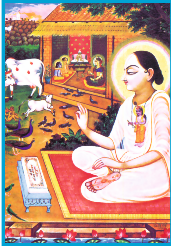
Jagad Guru Shrimad Vallabhacharya