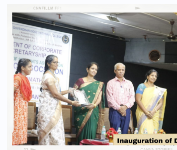
23 Inauguration of Department of Corporate Secretaryship