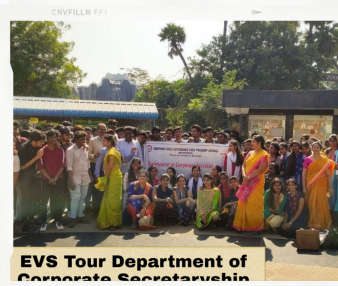
23 EVS Tour Department of Corporate Secretaryship