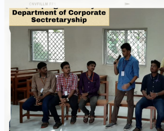
23 Department of Corporate Secretaryship