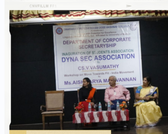
23 Inauguration of Students Association DYNA SEC ASSOCIATION