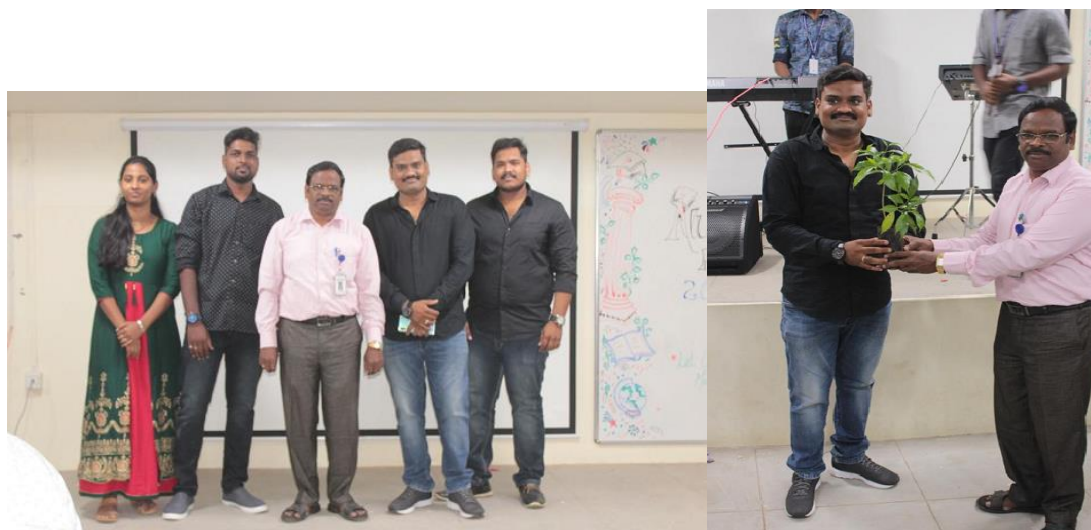
Members of the Alumni association body were selected

Event : ALUMINI MEET Venue : SEMINAR HALL Date : 11 TH JANUARY 2020 Organizers : Department of Computer Applications(B.C.A)